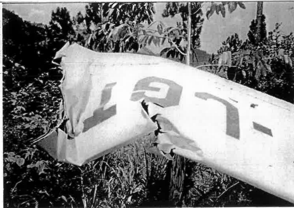
Starboard Wing leading edge broken by impact with Pine Tree and severed from the fuselage.