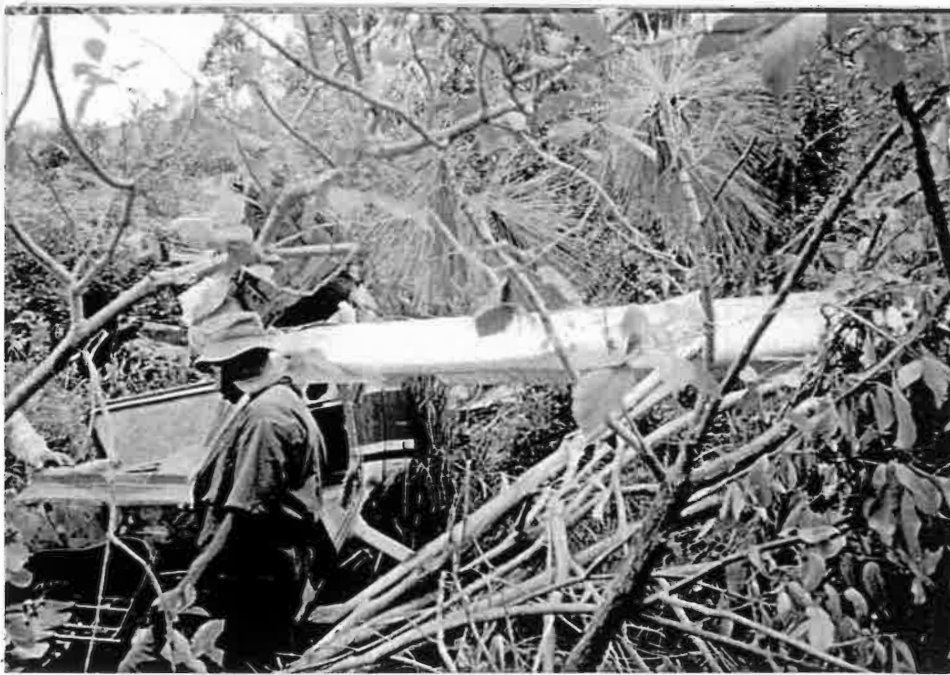
Density of young trees.