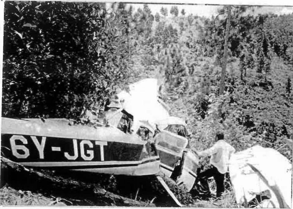
Port wing attached to fuselage and leading edge bent by impact with trees.