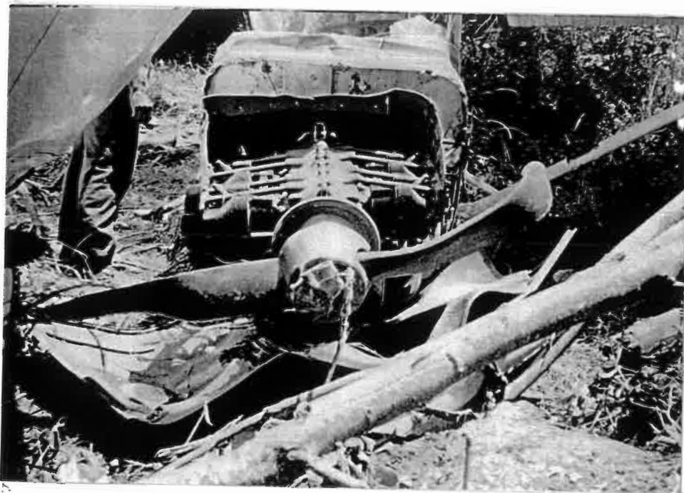
Closer inspection of Engine.