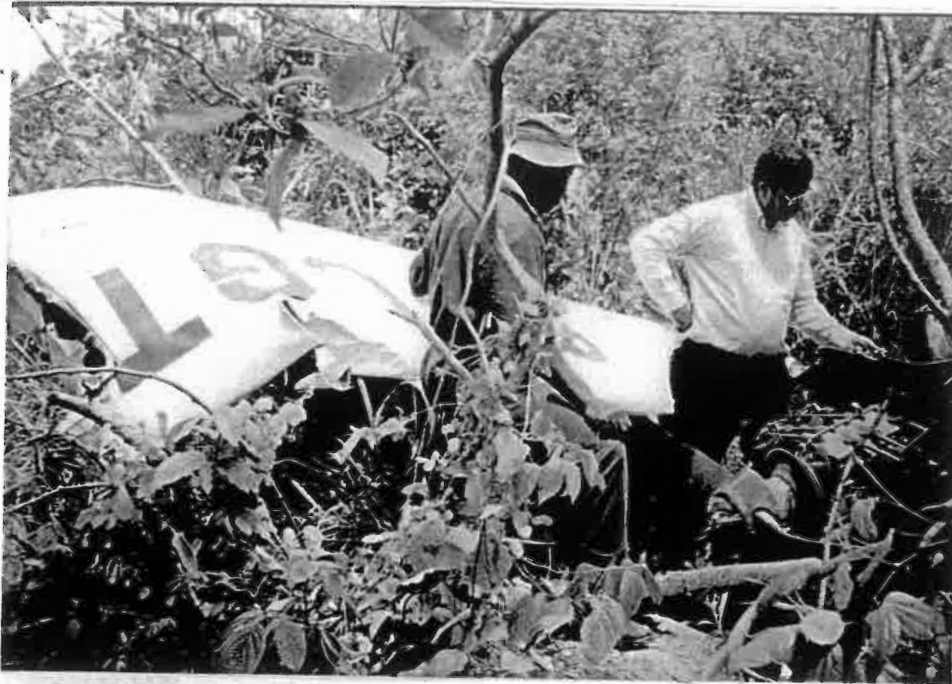
Engine moved forward from its mounting and both blades bent backwards.